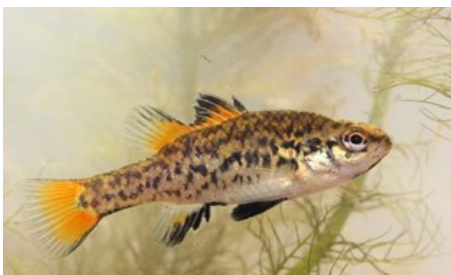
Southern Pygmy Perch - Luke Pearce