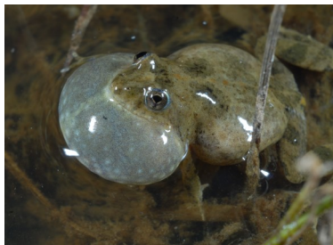
Sloane's Froglet