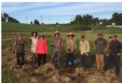
Left: Brunswick Valley Landcare (BVL) get down to business at 'The Farm—Byron Bay' restoring a creek line through formerly grazed headwaters.

Full story at: www.landcare.nsw.gov.au/groups/brunswick-valley-landcare-inc/hand-in-hand-riparian-restoration-farming-and-tourism