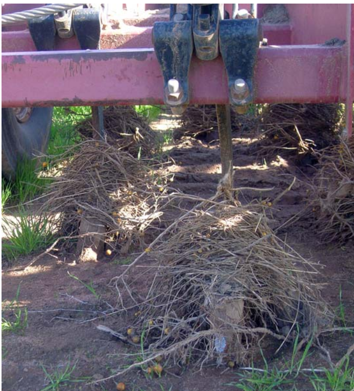
Silverleaf nightshade movement by cultivation

Several Eucalypt species have been identified that suppress silverleaf nightshade. In appropriate areas, tree belts could be established and used for long term control of small infestations. As well as providing natural control of weeds, tree belts also provide refuge for native fauna and shelter for livestock.