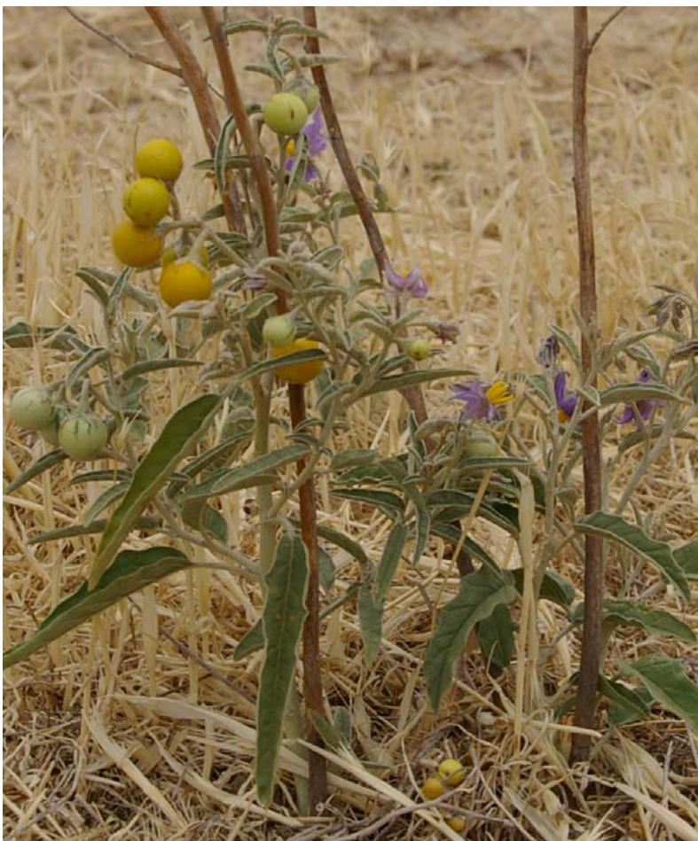
Silverleaf nightshade – photo courtesy of Rex Stanton

Ensure all livestock do not have any berries attached to their coat or feet. If there is a chance the livestock have been grazing where berries were present, or consumed fodder containing berries, quarantine stock in a small area for 14 days to allow any ingested seed to be excreted.