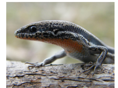
Boulenger’s skink ( Morethia boulangeri )