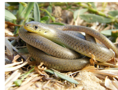
Olive legless lizard ( Delma inornata )

We hope that our research will in the future be useful for developing financial incentive schemes that target critical resources used by reptiles before any of these species are added to the threatened species list.