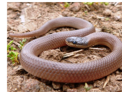
Dwyer’s snake, a small nocturnal snake