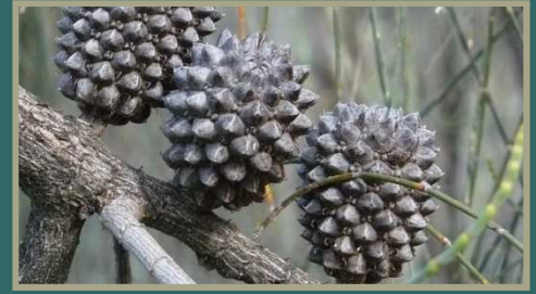
Drooping Sheoak Cones: Greening Australia