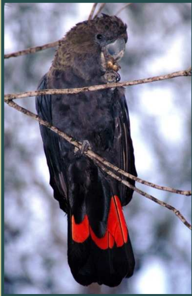
Glossy Black-Cockatoo: Stuart Harris