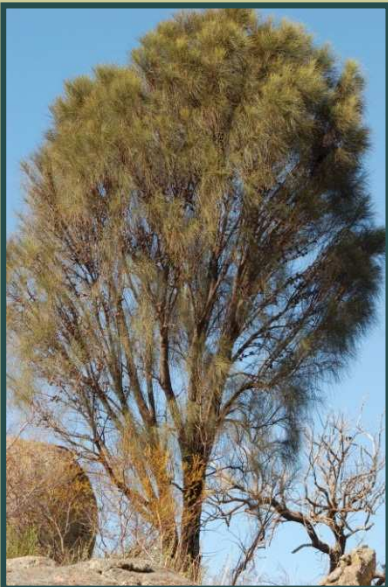
Drooping Sheoak: Greening Australia