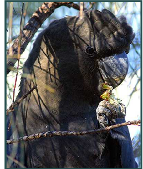
Glossy Black-Cockatoo: Geoffrey Dabb

The Glossy Black-Cockatoo is listed as vulnerable in NSW and the ACT. A number of factors have contributed to its vulnerability, including historical land clearing, ongoing loss of hollow-bearing trees, urbanisation and over-grazing. Its vulnerability is also related to its specialist feeding habits: it feeds exclusively on Sheoak species, which are particularly susceptible to browsing and lack of recruitment from inappropriate grazing. The Glossy Black-Cockatoo's main source of food in our region is the Drooping Sheoak.