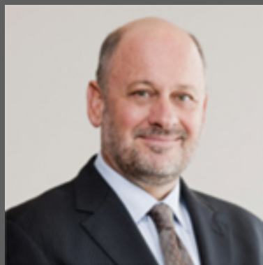
Professor Tim Flannery Climate Commissioner